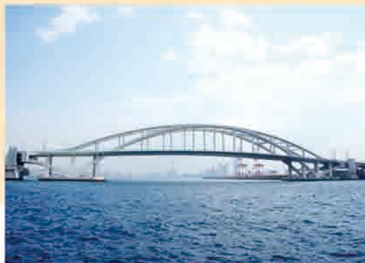
Yumemai Bridge (2001) Floating swing bridge