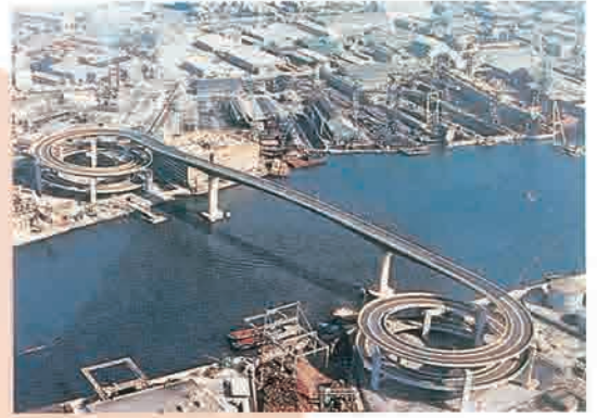
Senbonmatsu Bridge (1973) 3-Span continuous box girder with steel deck