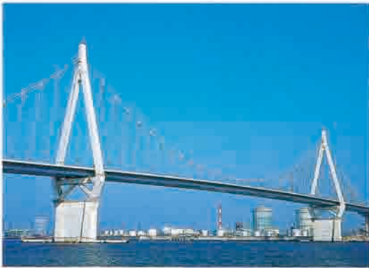
Konojima Bridge (1990) 3-Span continuous mono-cable self-anchored suspension bridge