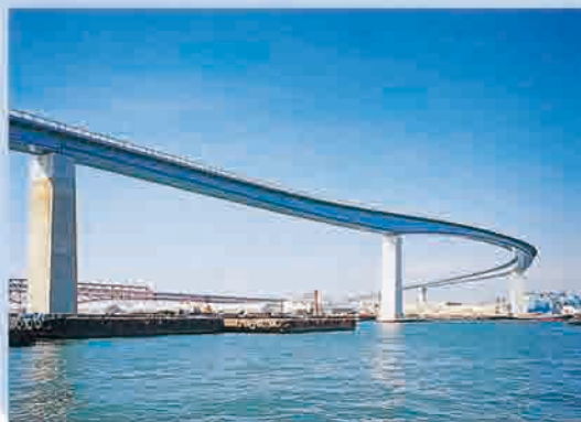
Namihaya Bridge (1995) 3-Span continuous curved box girder