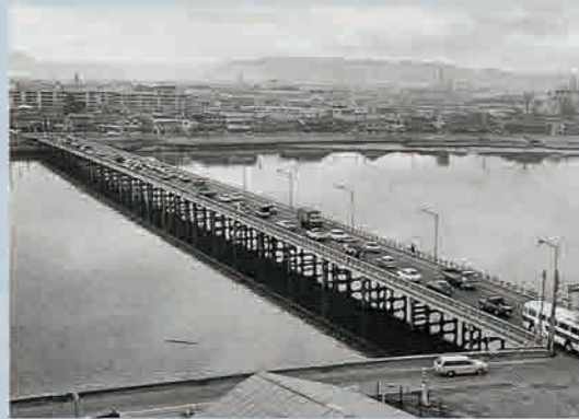
Kanzaki Bridge (1953) Composite girder