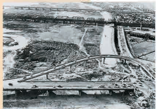
Nagara Bypass (1964) 3-Span continuous curved box girder