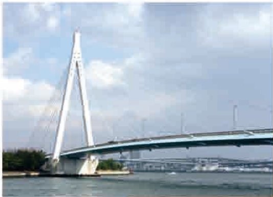
Tsuneyoshi Bridge (1999) Cable-stayed bridge