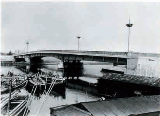
Kema Bridge (1960) 3-Span continuous composite girder