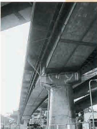
Kashima Bridge (1963) Box girder with steel deck