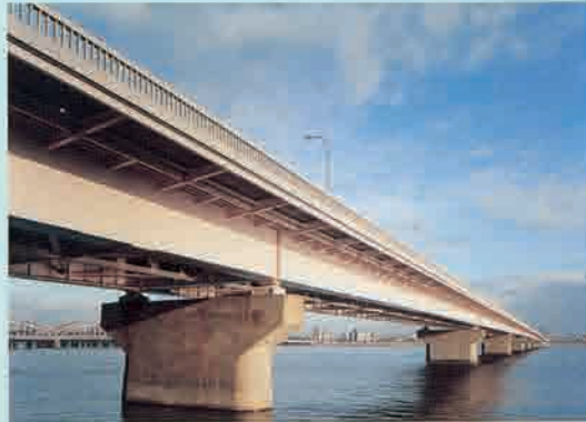
Shinjuso Bridge(1966) 3-Span continuous girder with steel deck (2-girder)