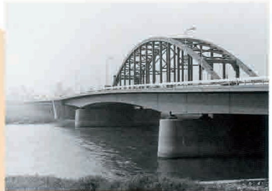
Shinyodogawa Bridge (1964) 3-Span continuous box girder with steel deck