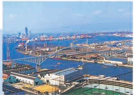
Shinkizugawa Bridge (1994) Balanced arch bridge