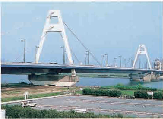
Toyosato Bridge (1970) 3-Span continuous cable-stayed bridge