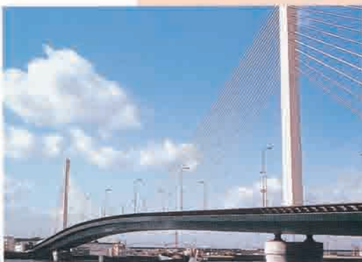
Kamome Bridge (1976) 3-Span continuous cable-stayed bridge