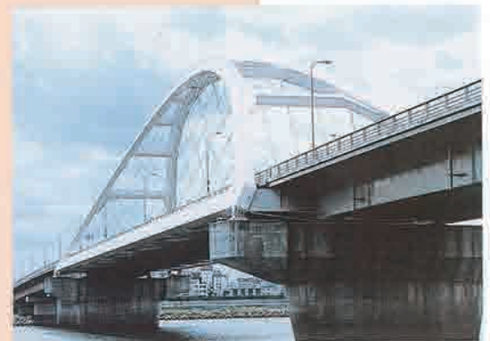
Nagara Bridge (1983) Lohse girder(Nielsen type)