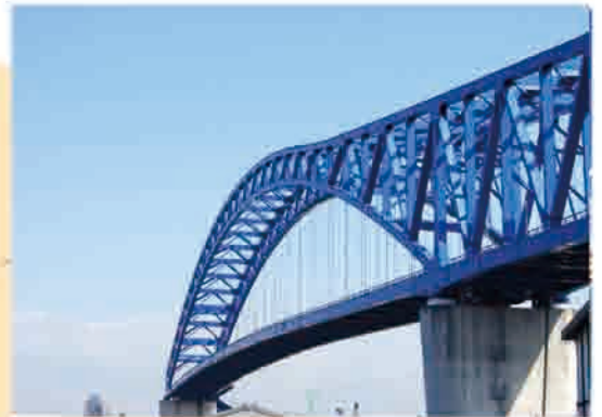
Chitose Bridge (2003) Braced rib arch bridge