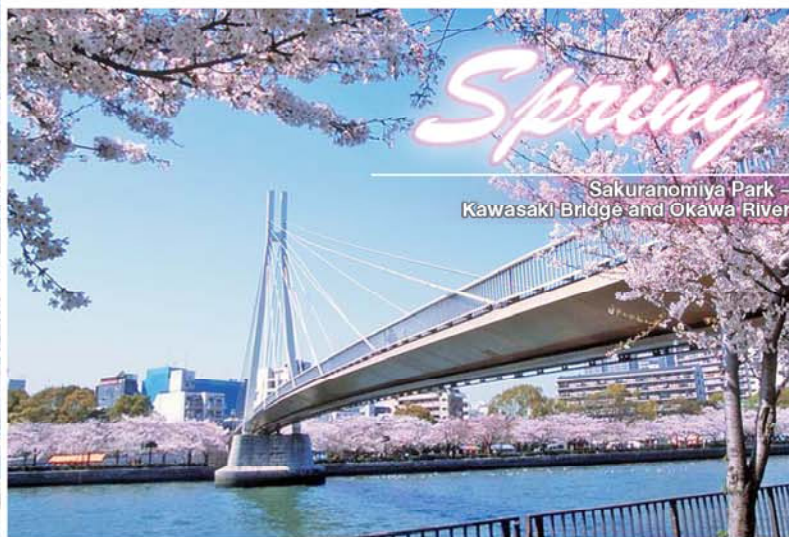
Sakuranomiya Park – Kawasaki Bridge and Okawa River