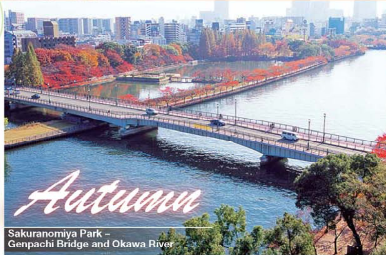
Sakuranomiya Park – Genpachi Bridge and Okawa River