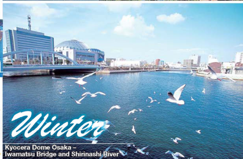
Kyocera Dome Osaka – Iwamatsu Bridge and Shirinashi River

12th Floor, Osaka World Trade Center Building 1-14-16 Nanko-kita, Suminoe-ku, Osaka 559-0034 TEL 06-6615-6818 (Bridge Department) http://www.city.osaka.lg.jp/kensetsu/