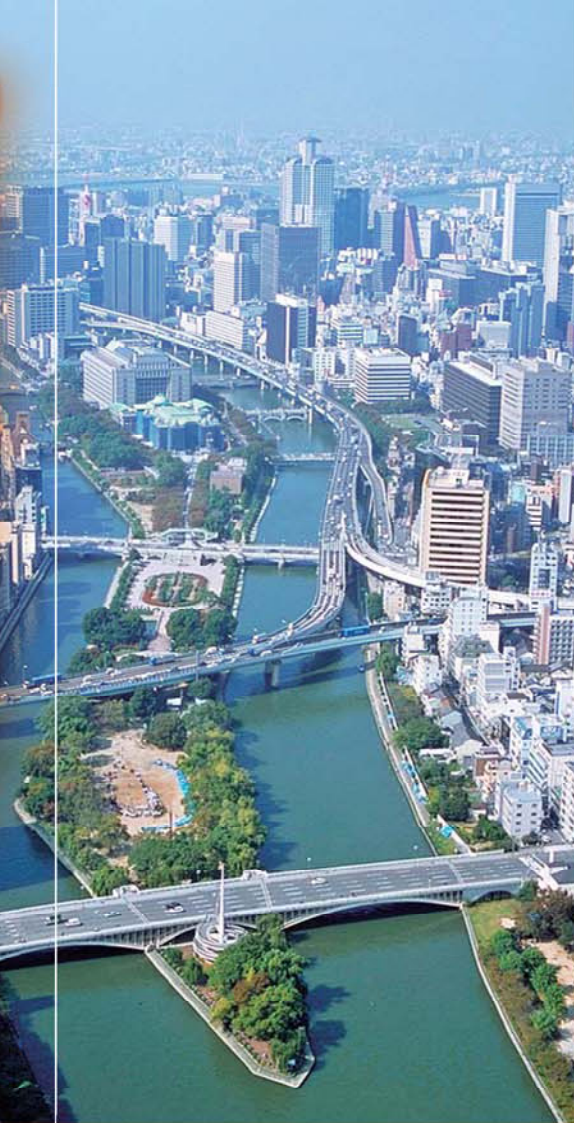
Aerial photograph of Nakanoshima

Osaka started as a town which grew from the mouths of rivers such as the Yodo River and Yamato River, and there are a large number of rivers and canals that flow through it. Over the years, as reflected by the expression "The 808 Bridges of Naniwa*", a vast number of bridges have been constructed in the city. For people living in the merchants' city of Osaka, these bridges have played an important role supporting the daily lives of its citizens and the development of the city.