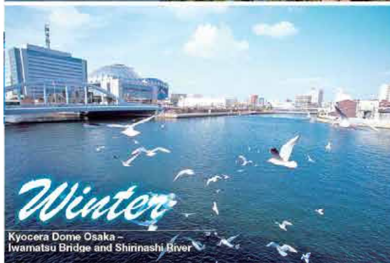
Kyocera Dome Osaka - Iwamatsu Bridge and Shiranashi River

Osaka started as a town which grew from the mouths of rivers such as the Yodo River and Yamato River, and there are a large number of rivers and canals that flow through it. Over the years, as reflected by the expression "The 808 Bridges of Naniwa", a vast number of bridges have been constructed in the city. For people living in the merchants' city of Osaka, these bridges have played an important role supporting the daily lives of its citizens and the development of the city.