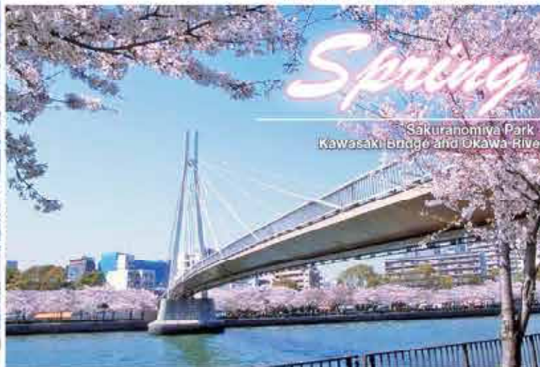
Sakuranomiya Park - Kawasaki Bridge and Okawa River