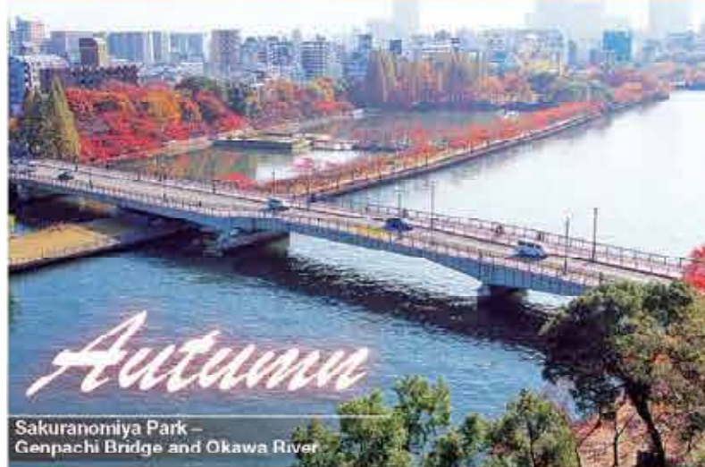
Sakuranomiya Park - Genpachi Bridge and Okawa River