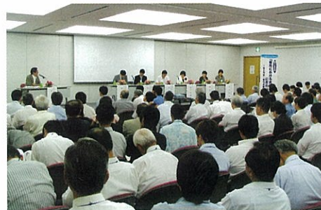
State of a discussion

With an eye to the next ICAP to be held in Busan, representatives of Busan as well as Seoul were also invited to this domestic symposium. They discussed with academics, citizens and students the ideal waterside spaces in urban areas needed for the future, as well as the creation of refreshing or bustling waterside spaces. As a result of these discussions, the participants successfully confirmed a shared view of what is required for the future of Osaka, the City of Water.