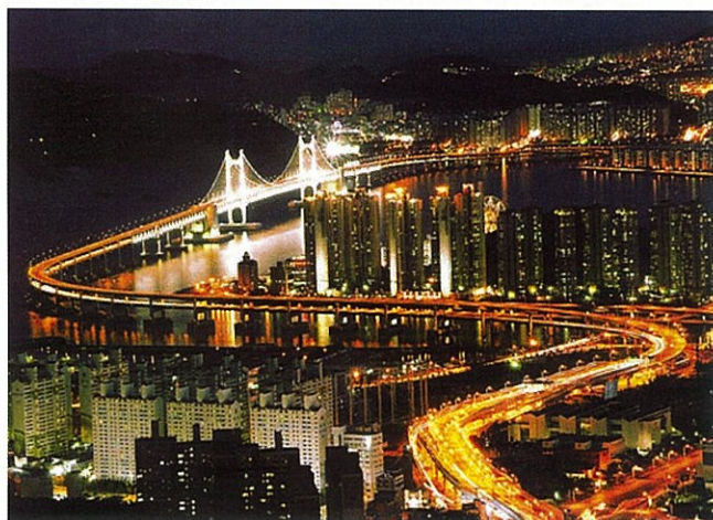
Road Network (Busan)

Situated along international air routes, Busan is not only a gateway to the Continent and oceans but also a logistical hub of northeast Asia. The air, sea and road traffic networks of Busan have a long history of development.