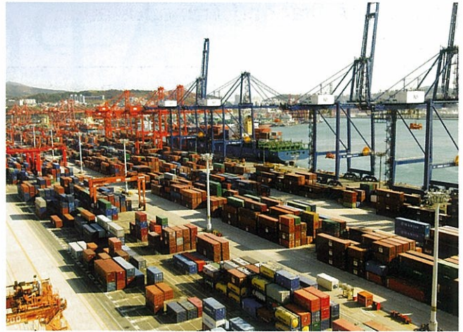
Port of Busan

Since its opening as the first international port of Korea in 1876, Busan has served as the driving force behind the country's industrial development, playing its role as an export base and also as a hub for maritime affairs and fisheries.