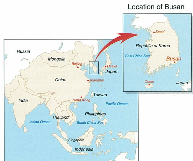
Map of Asia (South Korea is located in northeast Asia.)

Busan is a port city located in the lower southeast of the Republic of Korea in northeast Asia. With a population of four million, Busan is the second-largest city of South Korea and is also a city of international tourism. The name "Busan" is said to originate from the name of a cauldron-shaped mountain.