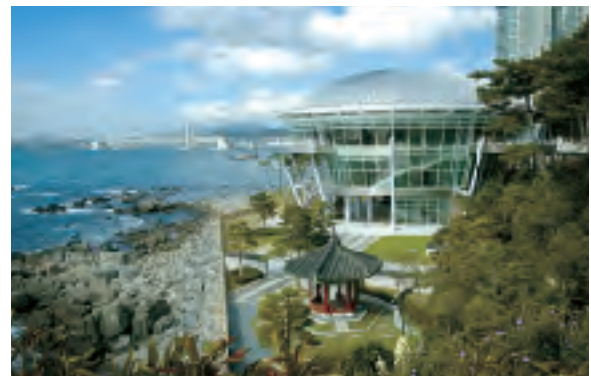
■ Nurimaru APEC House