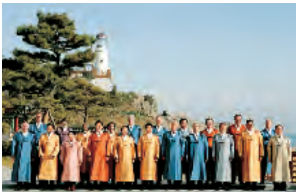
■ 21APEC Summit Leaders

APEC House, where the APEC Summit took place, is located on Dongbaek Island close to Haeundae beach, and about one kilometer away from BEXCO. Its major features include a theater-style conference room that accommodates 480 people, a banquet hall that can sit 360 people, and ten simultaneous interpretation booths.