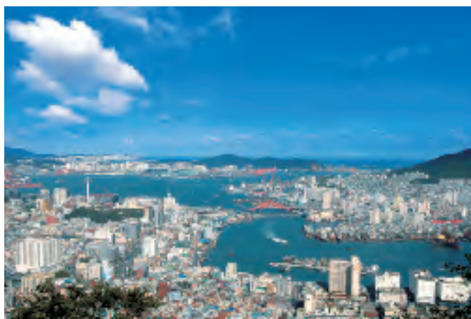
■ Busan Port

A detailed schedule and information on participation conditions will be forwarded to you separately by Busan City.