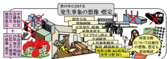
Figure "Envisioning and anticipating possible public risks or damage from a disaster"

Unipolar concentration in Tokyo is a big risk factor for Japan because the country has a high risk of disasters. It is desirable to strategically establish a core metropolitan region that can support Japan by preparing backup resources in an area unlikely to be hit by a disaster at the same time as Tokyo, as well as take on high-level functions even in normal situations.