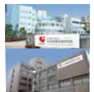
■ Osaka Research Institute of Industrial Science and Technology