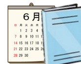
Calendars and paper files

(Remove fasteners: dispose metal ones as recyclable waste and plastic ones as plastic recyclables)