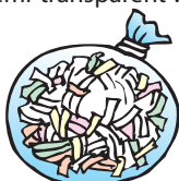
Shredded paper (Place in an individual bag)

Dispose of paper other than newspaper and ad inserts, cardboard, paper cartons, or magazines as miscellaneous papers. Tie them up with string or put them in a transparent or semi-transparent waste bag.