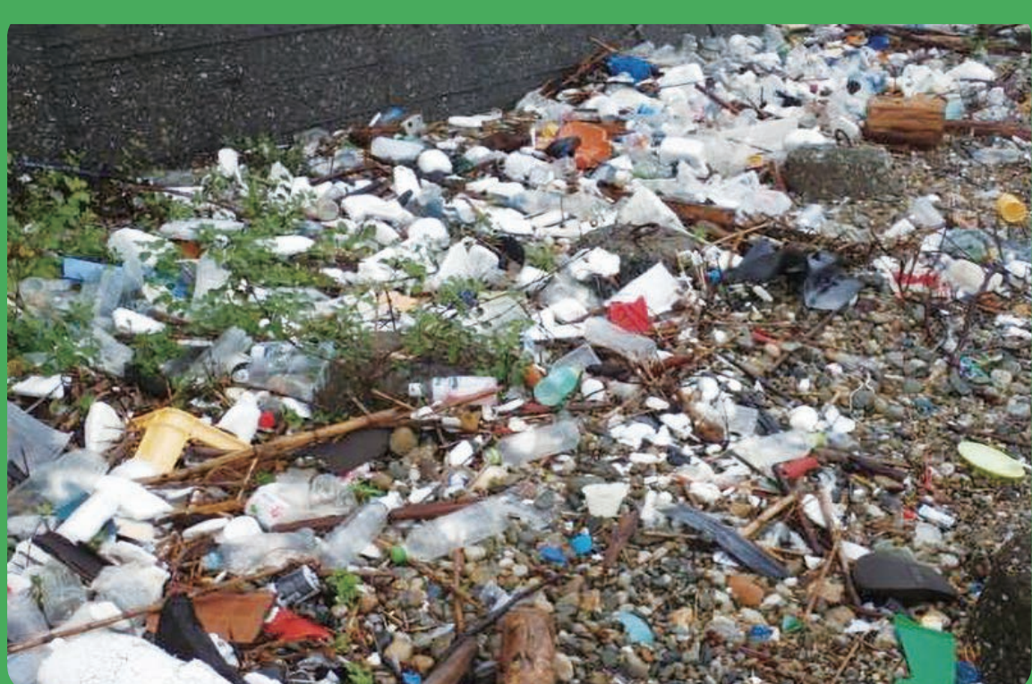
Garbage washed up on the shore