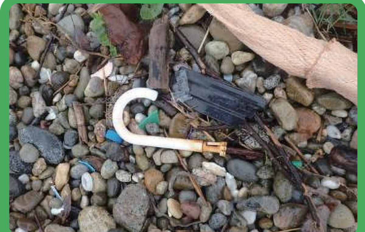
Plastic umbrella handle