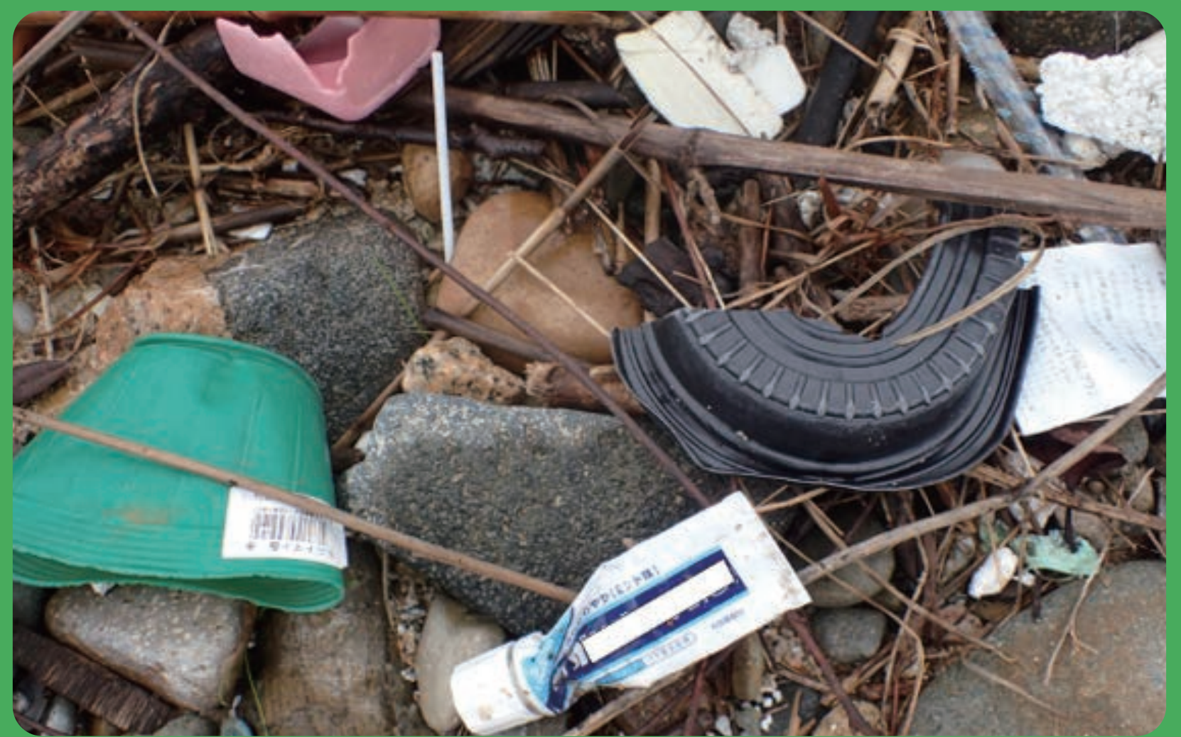
Garbage found on the riverbank