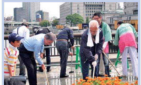
Nakanoshima Garden Bridge Cleaning

Local people take the lead in cleaning bridges, which are a symbol of the Osaka spirit. These bridge-cleaning activities help to bring people together and invigorate local areas.