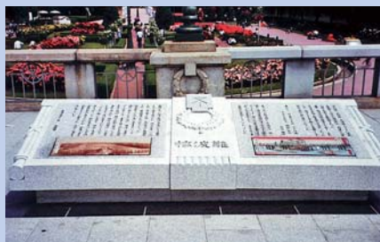
Monument on Naniwa Bridge

Monuments provide descriptions of the origin of bridges that have a close relationship with history, culture, and peoples' lives. In this, they reinforce the relationship between bridges and the people. In so doing, they encourage people to reflect on history and increase awareness of local areas.