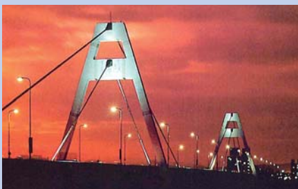
Toyosato-Ohashi Bridge illuminated at night

By lighting up bridges at night to create beautiful scenery, we strive to increase the level of pride, emotional attachment, and affection that Osaka's citizens feel towards their city, and also give visitors beautiful nightscapes to enjoy.