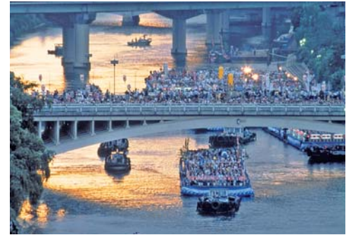
Tenjin Bridge (Tenjin Festival)

We will conduct maintenance in a way that reflects citizen opinion as well as historical value.