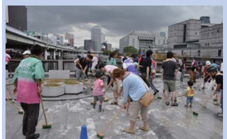
Nakanoshima Garden Bridge Cleaning

Local people take the lead in cleaning bridges, which are a symbol of the Osaka spirit. These bridge-cleaning activities help to bring people together and invigorate local areas.