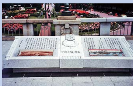
Monument on Naniwa Bridge

Monuments provide descriptions of the origin of bridges that have a close relationship with history, culture, and peoples' lives. In this, they reinforce the relationship between bridges and the people. In so doing, they encourage people to reflect on history and increase awareness of local areas.