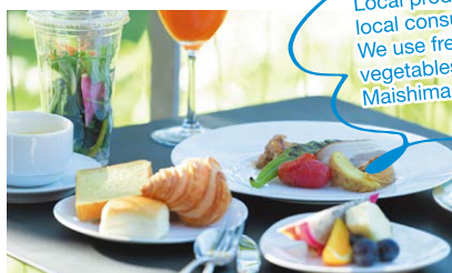
Garden Terrace Maishima Kitchen

Local production for local consumption! We use fresh local vegetables grown on Maishima Island.