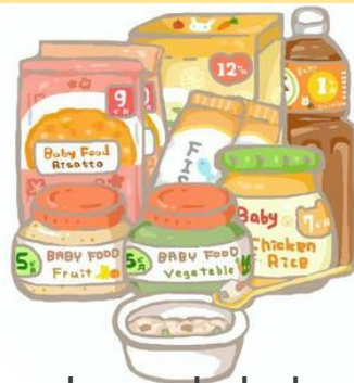
Ready-made baby food