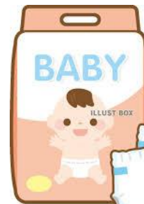
Diapers and Wipes