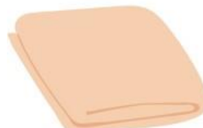
Cape · Blanket