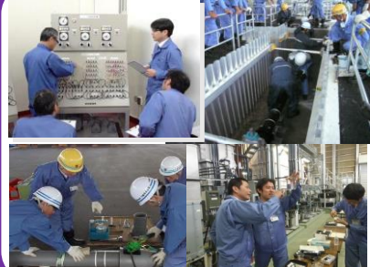
Experience-Based Training Center