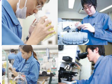
Water Examination Laboratory