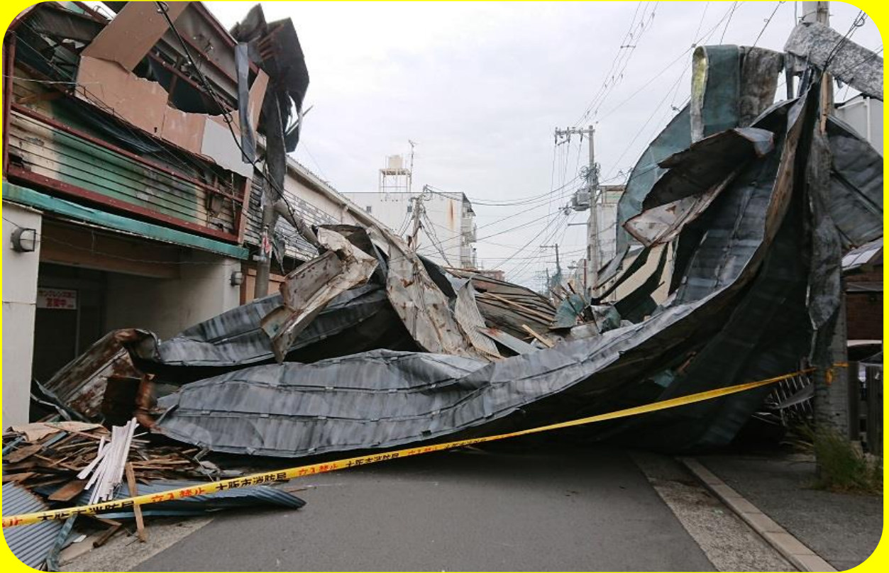
Photo of Osaka City area damaged by Typhoon Jebi in 2018.

During the Great Hanshin-Awaji Earthquake , mutual aid shared amongst neighbors was vital in carrying out rescue efforts. Community ties can support you and your family. Would you like to work with us in building a well-connected town where neighbors can readily rescue and support one another?