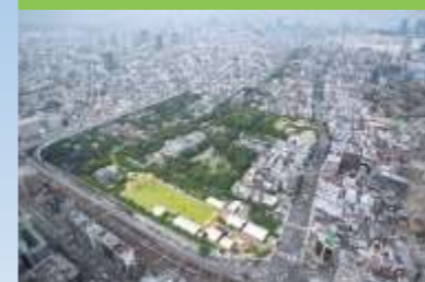
Tennoji Park Entrance Area TEN-SHIBA

and (Culture center, clothing shops, etc.)