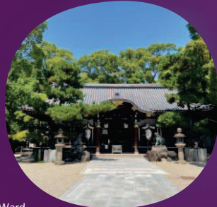
#HiranoWard # Urban Landscape Resources # Kumata Jinja Shrine