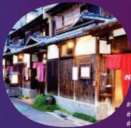
#AbenoWard # Urban Landscape Resources # Teranishi Abeno Tenement House / Teranishi Residence