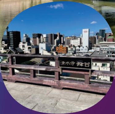
#TennojiWard # Urban Landscape Resources # Kiyomizu-dera Temple